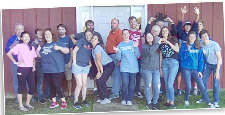
The "unofficial" picture of participants in the 2021 All-CID Campus Ministry Retreat.