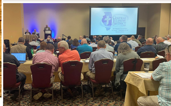
A packed house at the convention.